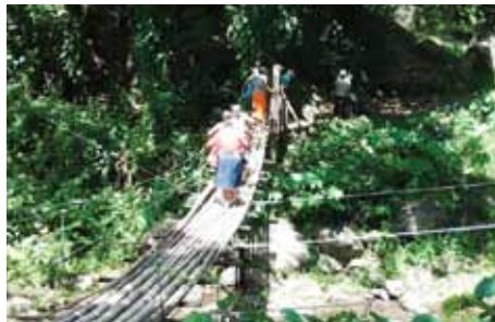
Members fearfully attempted to cross a bamboo bridge leading to the waterfall.