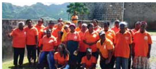
Group photo up at Fort Charlotte.