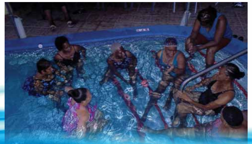
Member relaxing in the pool at Papa B's