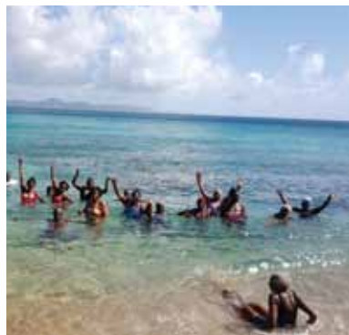
Members had a fun day at the beach.