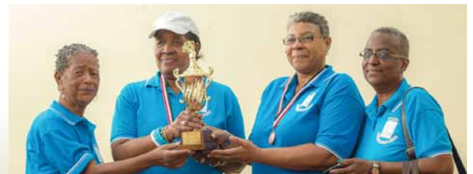
All Fours winners in their glee.