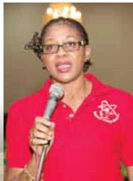
A member asking questions during the Question and Answer Segments.

We encourage our members to frequently check our website at www.ttarp.org , as well as to find us on Face Book as Ttarp Responsible Persons.