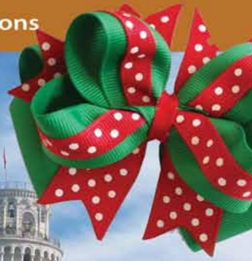
The Leaning Tower of Pisa, Italy.

THE WORLD IS A BOOK, AND THOSE WHO DO NOT TRAVEL, READ ONLY A PAGE.