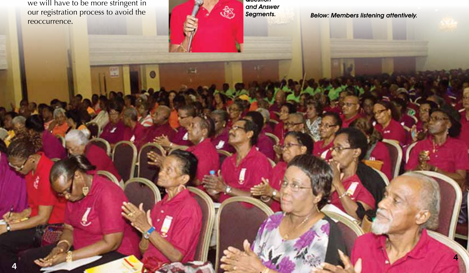
Below: Members listening attentively.