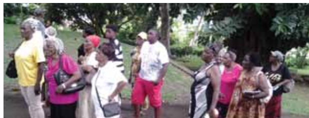
Right: Members go for a stroll in the gardens.