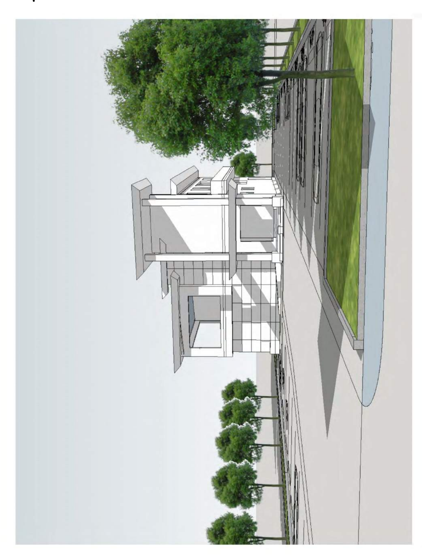
Perspective I – Front of TTARP Administrative Head Office