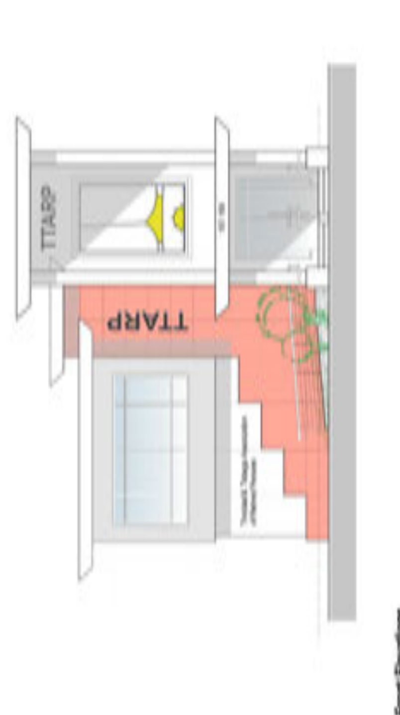
Appendix I Illustrations of TTARP's Proposed Head Office